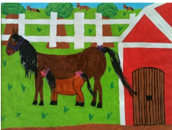
"Pony Palace" by Pip Ireson