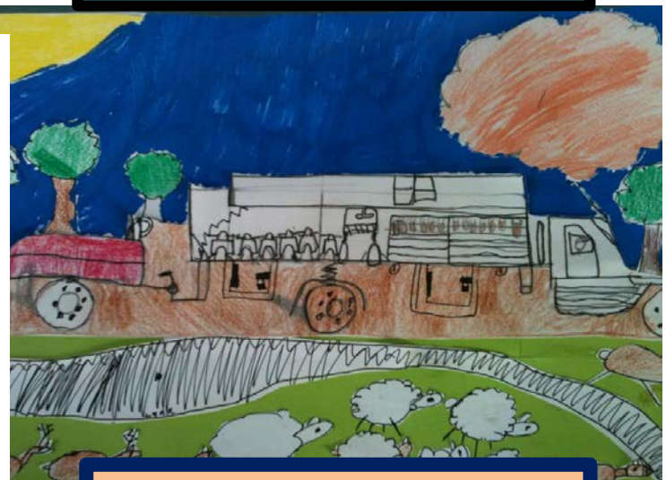
Lane Job's country theme, "Driving the Dusty Road".