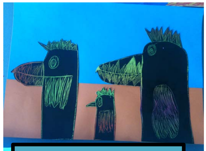
Tom's Artwork –The Three Birds