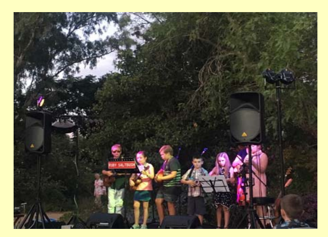
All the world's a stage...

The Booligal Bugs—Ukulele group recently performed at Bishops Lodge in Hay as the opening act for local band Ruby Saltbush. The students were delighted to play their most recent gig under lights for the most appreciative crowd.