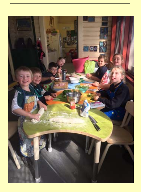
Pizza production line