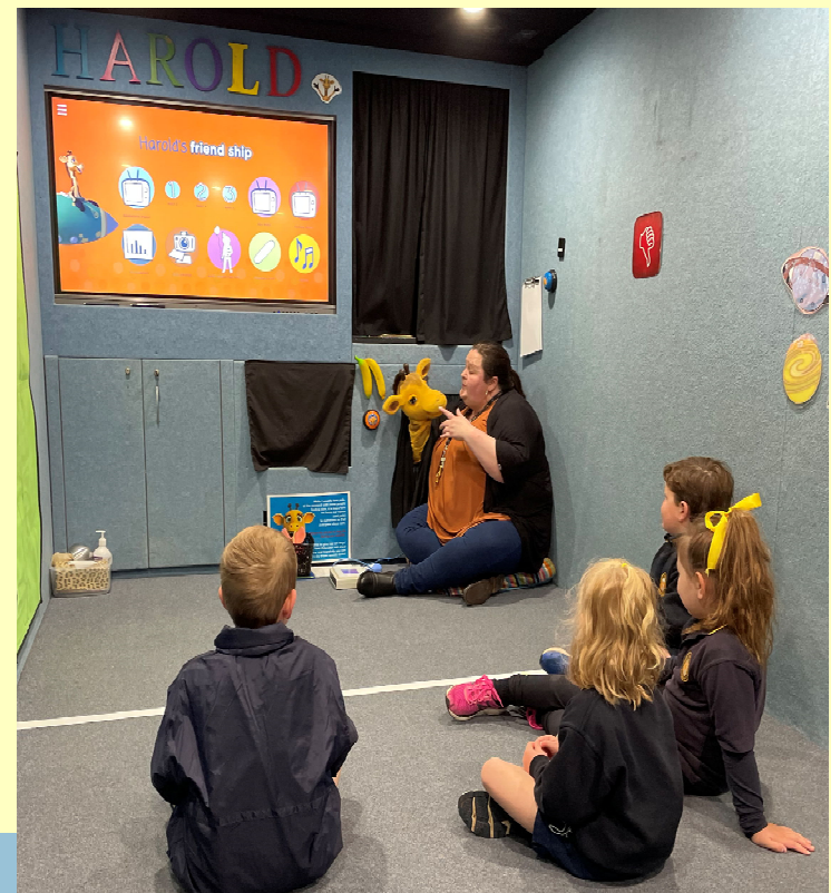
Stage I getting some great tips from Healthy Harold!

Alongside Life Education, Healthy Harold has been visiting schools for 40 years. The lovable giraffe delivers a fun and interactive session that promotes an active, healthy lifestyle.