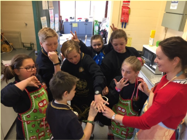
Taste testing the icing

The students have enjoyed their cooking sessions with Mrs Turner this term, including producing their very own individual chicken pies, ceaser salad and apple pie with apples from the Kitchen Garden. However the highlight of this term was Show Cooking day in preparation for the annual Hay Show. The students all made biscuits, picklets and decorated cup cakes. Thanks to everyone who made it possible to enter 21 separate items!