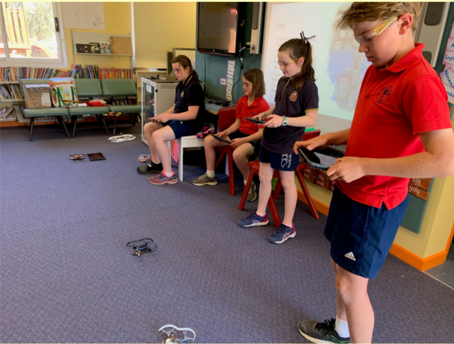
Hay SOTA and BPS students learning the finer points of drone f flying.