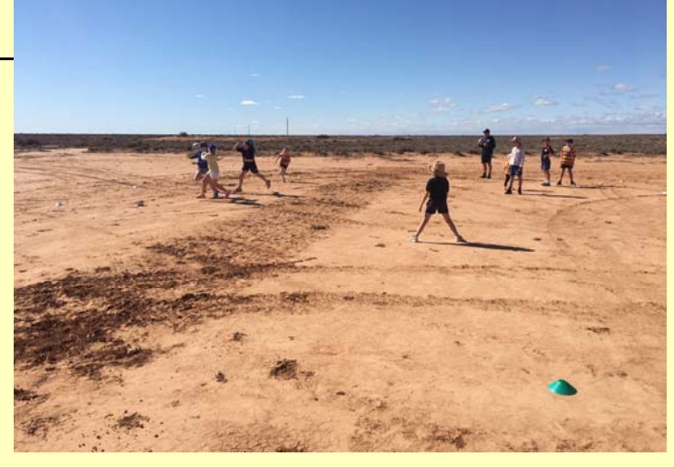
Clay pan rugby @ "Curragh"