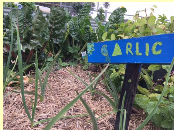
Hand painted garden signs

Then we looked at drones—flying a tiny little one in the classroom which we could program to do flips. We built our own robots using lego kits. I focused on making mine as fast as possible, we used engines to make them move and our ipads to control them. We made an automatic vehicle first and then we changed it to a vehicle with gears using the cogs. I made a lot of adjustments to my robot to make it faster. Everyone lined up for a race—but mine kept falling apart! The best part of the day was building and designing your own robot.