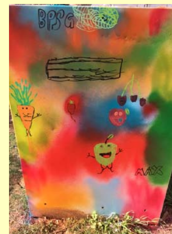
Max Spence' amazing design

Also in the garden we have been planted beans and tomatoes.