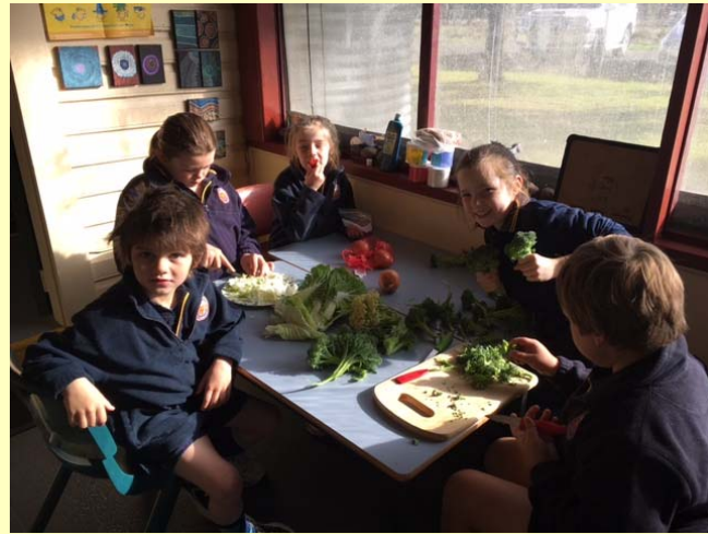
Preparing our pie fillings.

We were all very excited to discover that BPS now owns a pie maker! At our last SAKG kitchen session we