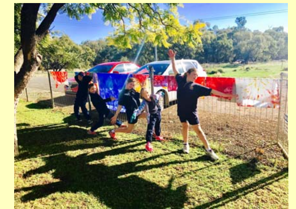
Tie Dye designs hanging on the line

different colours. When we took the material out we found our very own tie dyed designs.