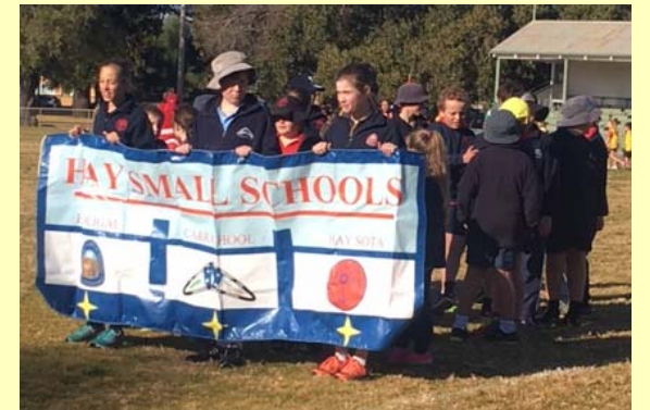
Marching with all the Hay Small Schools