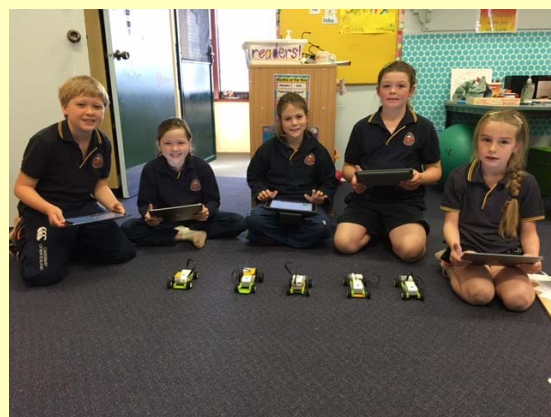
The great race!

We used ipads with apps to program smaller robots to follow the path we chose.